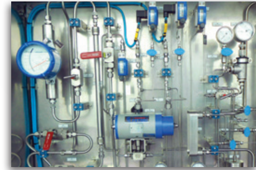
3 Sample conditioning